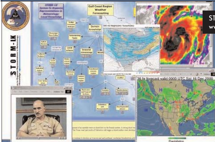
STORM CONCEPT MAP www.coginst.uwf.edu/STORM-LK

In collaboration with IHMC, we hope to use these tools to do for electric power management what STORM did for meteorology.”