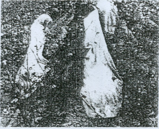
Ben Shahn, Picking cotton, 1935.

The Statue of Liberty, a lovely gift from France, symbolizes the fact that, except for the Native Americans, also known as Indians, the rest of people in the USA come from other countries. America is the melting pot, the land of immigrants. Millions of Chinese, Italians, British, French, Germans,