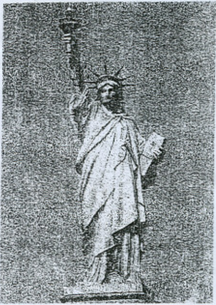
The Statue of Liberty.

Philadelphia on July 4, 1776, not only placed the thirteen colonies in open rebellion against the mother country, but also announced the birth of a new nation – the United States of America. The 13 stripes on the American flag represent the original 13 colonies; the fifty stars represent the fifty states. The three colours of the flag, blue, white and red are the same as those of the British flag.