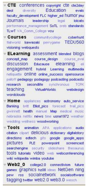
screencapture tag cloud del.icio.us/bwatwood taken on Nov. 23, 2007

In most browsers, websites can be saved using bookmarks, but only one bookmark can be used to describe a website. This can be limiting. For instance, one might want to save a recipe from a Food Network episode, and so use the bookmark "recipe". If one does this frequently, it become difficult to cull out the cake recipe from all the other recipes one has saved! However, in Delicious, one uses "tags" to describe the links one saves. Tags are one-word descriptors for websites, and a single website can have multiple tags (recipe, cake, birthday, favoritecakes, etc.) (Delicious, 2006b). In Delicious, a collection of tags (known as a tag cloud) can be organized categorically, as I have done in my tag cloud below. Tag clouds can actually give one a glimpse into the mindset of the owner, as I found in reviewing the tag clouds of my students.