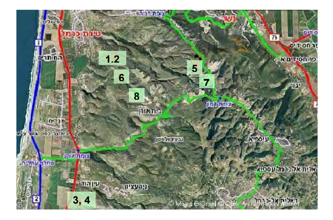
Figure 1. Map of the proposed burned and unburned study plots, for more details see table 3.