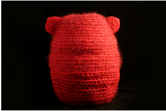
Fig. 1 momo with casing

skill in these computational modes is like remembering a recipe in order to use an application for a desired outcome. [20] The newer generations of haptic interfaces (e.g., multi-touch screens, gestulative gaming, tactile keyboards), allow cognitive processes to be carried out on a basic physical level, but the level of the physicality is still inherently learned and not wholly intuitive. The model still lies on a think-first-and-