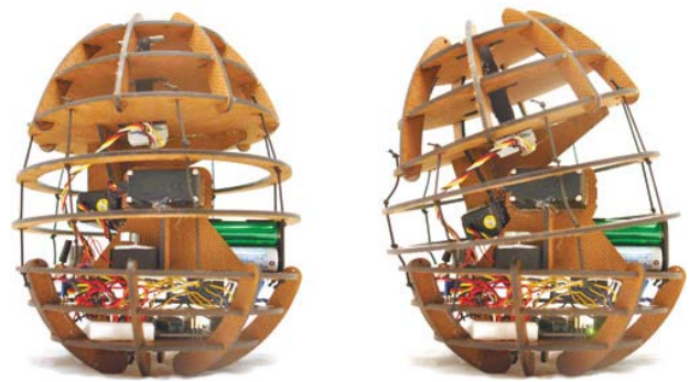
Fig. 2 momo interior

valuable experience. (fig. 3) Pulse Presence is a modular structure that hangs on either side of a wall. Attached