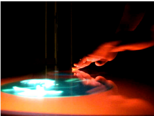
Fig. 5 TouchKit Turntable

Further discussion is required in developing more practical ways of integrating affordance models, object-task performance, and exploratory learning processes within GUI.