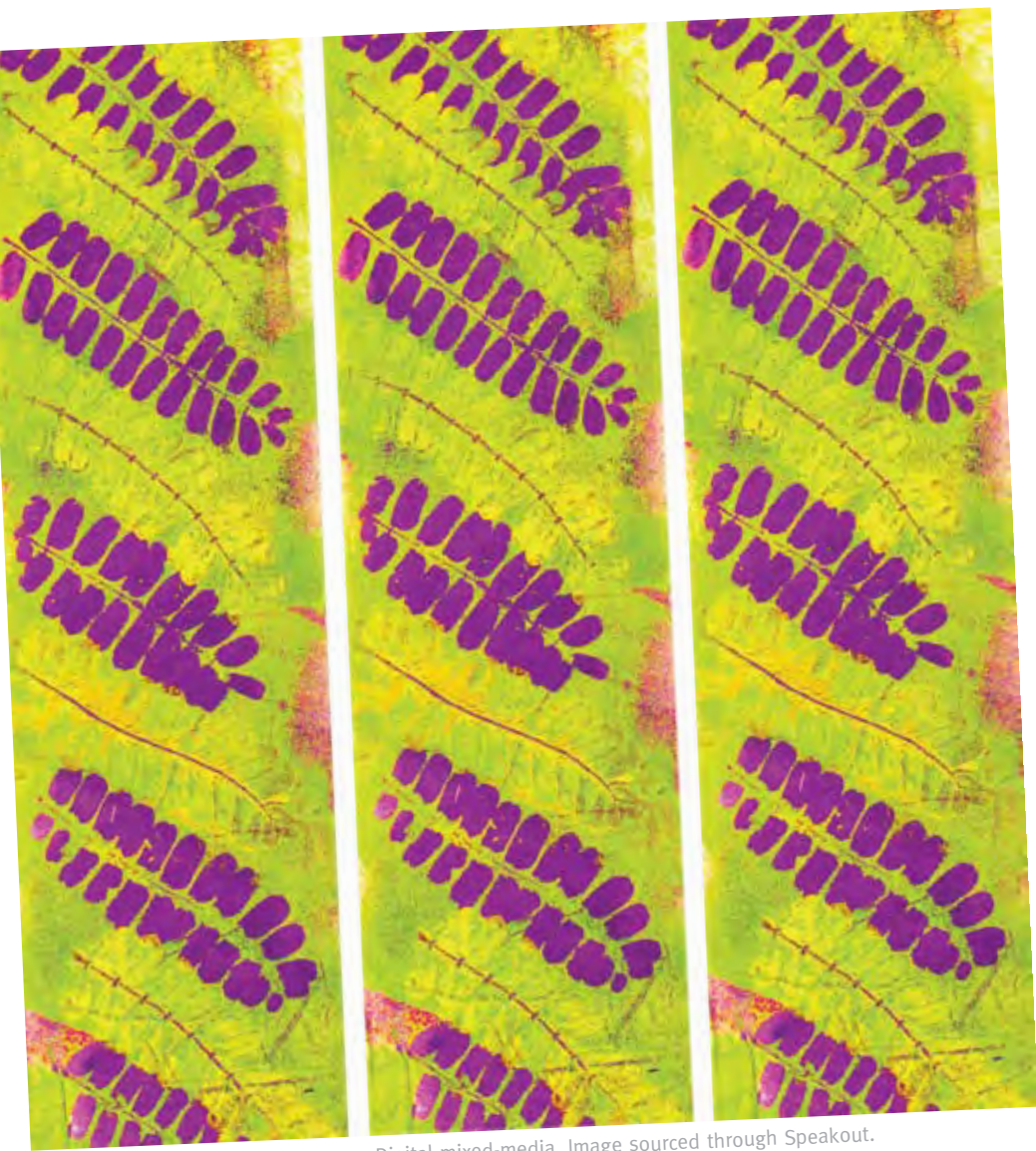
Jade Thomson. Colourful Ferns , 2007. Digital mixed-media.