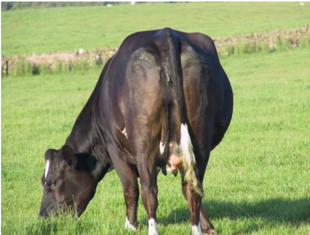
Fig 6: Fog fever is an uncommon condition causing severe respiratory distress in adult cattle one to two weeks after moving on to a lush silage/hay aftermath in June/September.

Circumstantial evidence links the disease with the ingestion of large amounts of the amino acid L-tryptophan and its conversion in the rumen to 3-methyl indole and indole acetic acid.