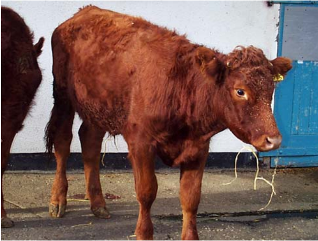
Fig 5: Chronic suppurative pulmonary disease caused by persistent BVD infection.