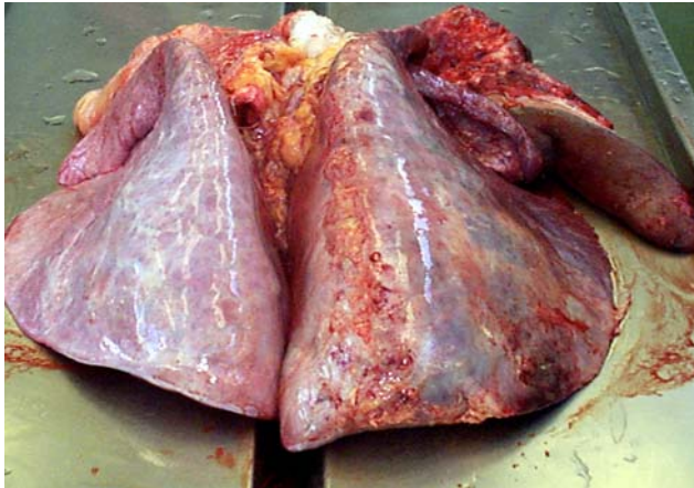
Fig 8: Severe necrotic pneumonia and pleurisy (right lung) following inhalation of rumen content (see Jersey cow in above image).

Treatment is unlikely to be effective but broad spectrum antibiotics plus NSAID such as flunixin meglumine should be administered with the cow re-examined the following day because humane destruction may be necessary for welfare reasons if the animal deteriorates further.