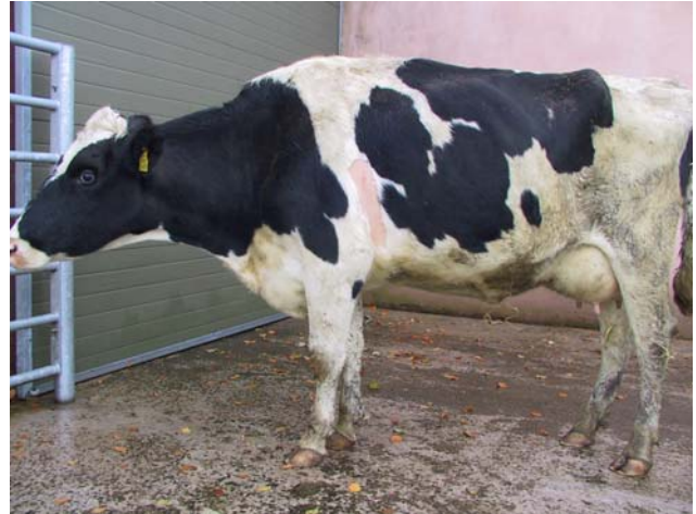
Fig 3: Cattle may stand with an arched back with the neck extended and the head held lowered suggestive of thoracic pain.

occasional nasal discharge. The respiratory rate is increased with an abdominal component to respiration. Some cattle stand with an arched back with the neck extended and the head held lowered suggestive of thoracic pain.