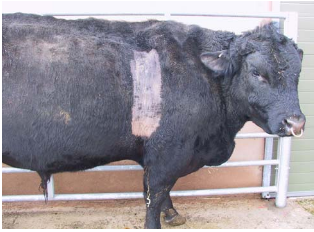
Fig 9: Chronic weight loss in an Aberdeen Angus bull with a massive pleural abscess.

Care with drenching; appropriate supervision of calving cows with prompt treatment of hypocalcaemia.