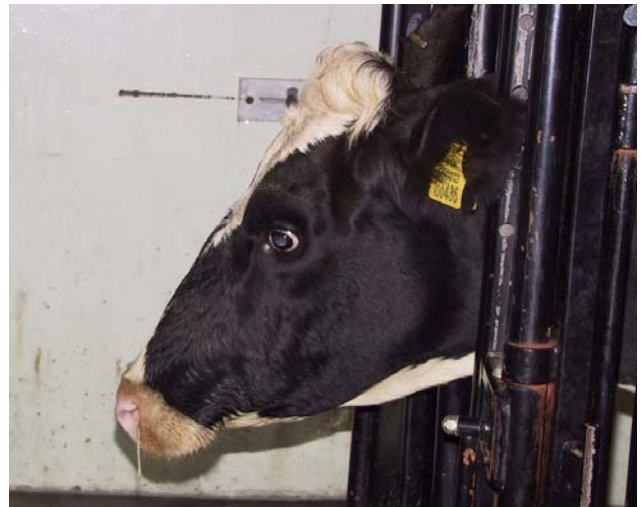
Fig 4: Affected animals cough frequently and have a purulent nasal discharge.

Your veterinary surgeon will check for other chronic bacterial infections including liver abscesses, endocarditis, hepatocaval thrombosis, and chronic peritonitis.