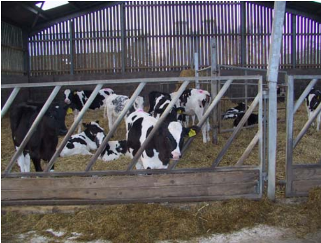
Fig 1: Chronic suppurative pulmonary disease develops as a result of unsuccessful treatment or incomplete recovery from earlier pneumonia episodes as growing cattle.

Chronic suppurative pulmonary disease develops as a result of unsuccessful treatment or incomplete recovery from earlier pneumonia episodes. Flare up of bacterial infection within the lungs is often associated with a stressful event such as transport, sale or, most commonly, calving. Salmonellosis, particularly Salmonella Dublin infection, and Johne's disease are other examples of recrudescence of infection following calving.