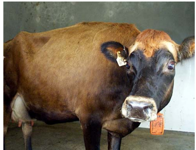
Fig 7: Jersey cow with inhalation pneumonia following recumbency caused by milk fever.

Typically, the cow has a painful expression and stands with a roached back stance with the neck extended and the head held lowered and walks slowly. The animal does not eat. The rectal temperature is elevated within a range 39.5 to 40.0°C. There is a bilateral mucoid/purulent nasal discharge and the animal coughs frequently. The respiratory rate is elevated with an obvious abdominal component. The cow has halitosis. The milk yield is greatly reduced.