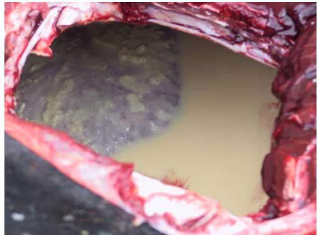
Fig 11: Necropsy of the bull featured left confirmed a massive pleural abscess containing over 50 litres of pus.

Affected cattle often stand with a roached back stance with the neck extended and the head held lowered with a painful expression. The cow's appetite is reduced. The rectal temperature is only marginally elevated (39.0 to 39.5°C). There are no ocular or nasal discharges. The respiratory rate is elevated with an obvious abdominal component as the abscess often occupies a large proportion of the chest. A large pleural abscess may contain up to 50 litres of pus.