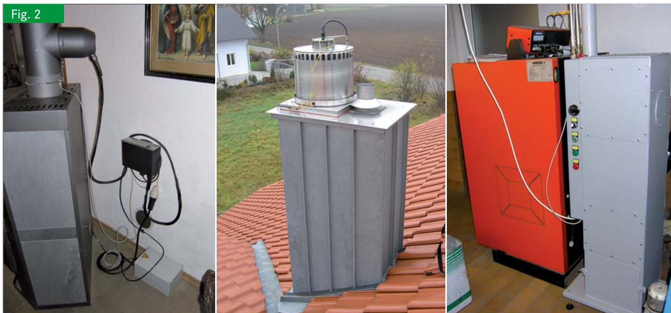
Examples of precipitators used in field tests; left: Zumikron in flue gas pipe of a stove; middle: APP R_{\text{residential}} ESP in chimney top; right: Spanner SFF20 with pellet boiler.