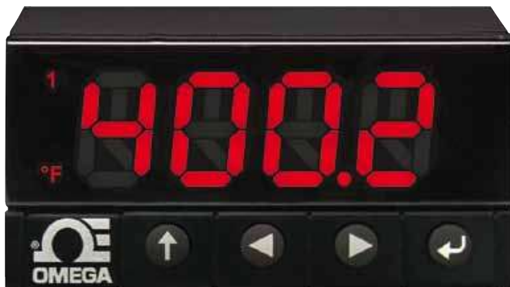
DP8PT, shown smaller than actual size.