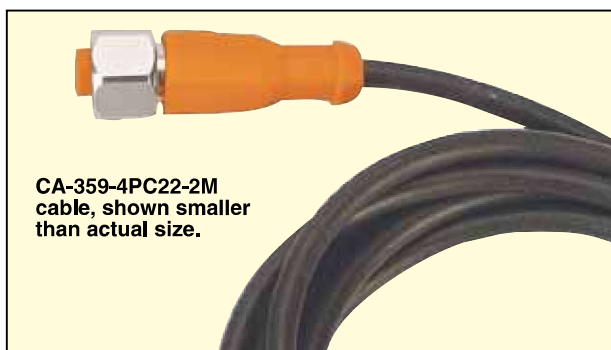
CA-359-4PC22-2M cable, shown smaller than actual size.