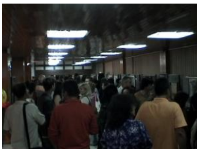
Figure 1 Peace Day Exhibition Skopje, Republic of Macedonia

With the project’s conceptual roots in a personal analysis of community development issues related to community health, new models for regional economic development, technological & social innovation, as well as civic engagement and value are all fundamental to the work. Since its beginning marked by a collaboration with NGO Art Studio in the Republic of Macedonia for the International Day of Peace Exhibition, thousands of people have been introduced to the work, its concepts, its benefits, and joined our online groups or Cultural Fusion Experience radio show - to become part of the team to make the dream reality.