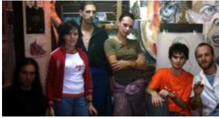
Figure 2 Director and students from NGO Art Studio Skopje, Republic of Macedonia

Media and institutional discussions about solutions and how such projects should be developed have not been adequately informed by the way peer to peer, "self referencing creativity" as an expression of creative freedom, and self organizing system infrastructures are taking shape. Each of these phenomenon has, as least in part, been powered by the fast pace of social media and the internet. It turns out the information superhighway is leading us somewhere.